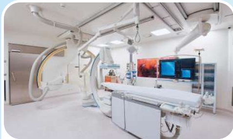
01. Hospital Equipment and Infra