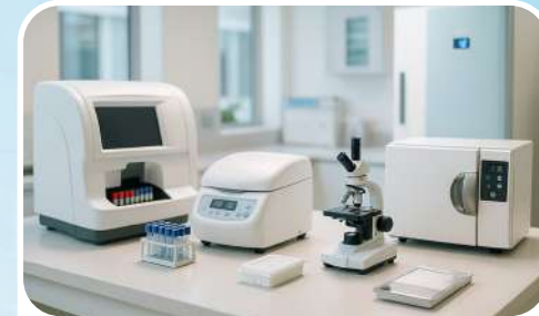
03. Laboratory Equipments