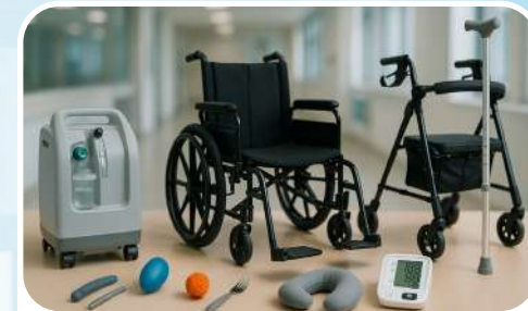
06. Home-Care & Rehabilitation