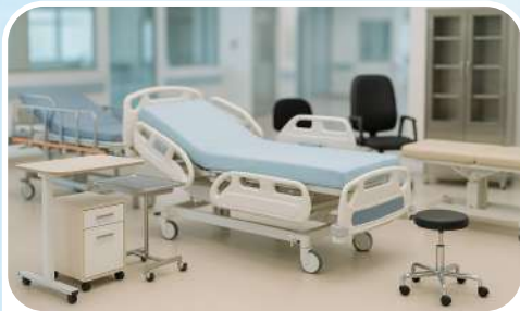
04. Medical & Hospital Furniture