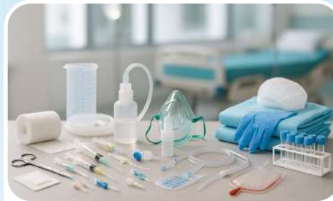
02. Hospital Consumables