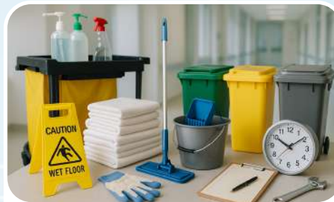
05. General Facility & Support Supplies