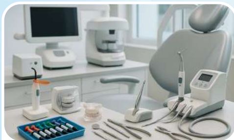
07. Dental Care