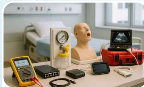
08. Miscellaneous & Support Systems