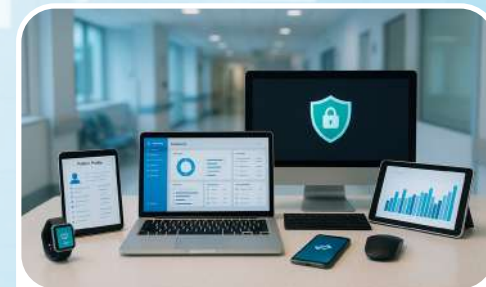
09. SOFTWARE SOLUTION